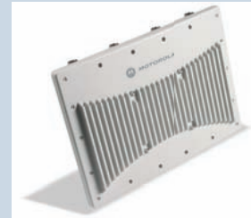
AP-5181 Dual Radio AP AP-5181-13040-WWR