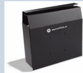
Heavy Weather Kit KT-5181-HW-01R