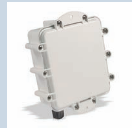
48V Transformer and Power Surge Protector AP-PSBIAS-5181-01R

Not Shown: Wall Pole and Mounting Kit KT-5181-WP-01R